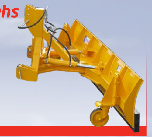
550mm High Snowblade