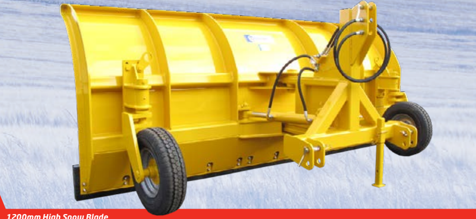
1200mm High Snow Blade