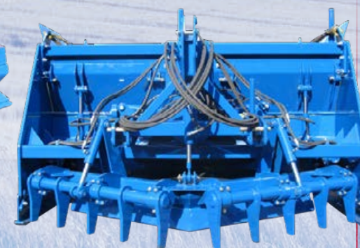
Grader and Gravel Layer