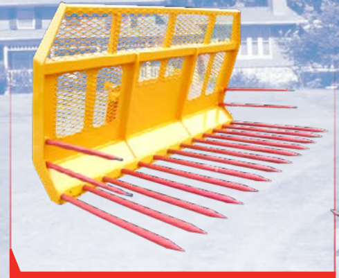
9' Contractor Model Grass Fork