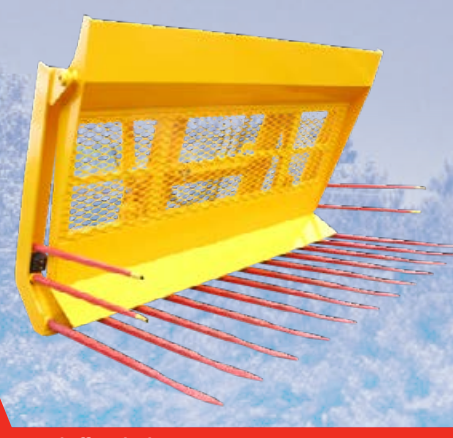
9' Pushoff Buckrake - Tractor Type